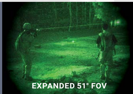
EXPANDED 51° FOV