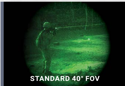
STANDARD 40° FOV